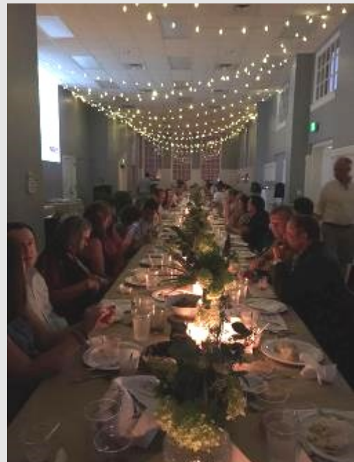
Photo from Murray's Market to Menu that was held on July 29th